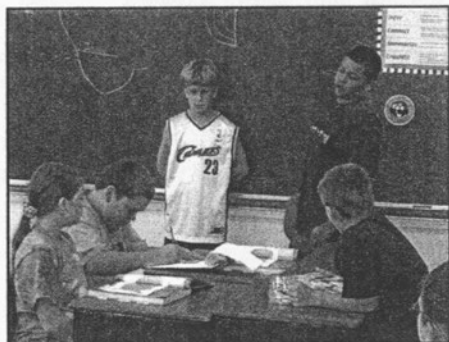
Students petition for change.

The fourth theme, Freedom to Assemble, was taught through examples of Dr. Martin Luther King, Jr. who practiced peaceful assembly. The kindergarten class modeled this at an assembly. They had raised the concern of garbage on the playground. Through class discussions, they decided that having garbage cans outside could solve the problem. They also made signs and assembled to convey their ideas of stopping the litter on the playground. This highlights civic engagement even in the lower grades.