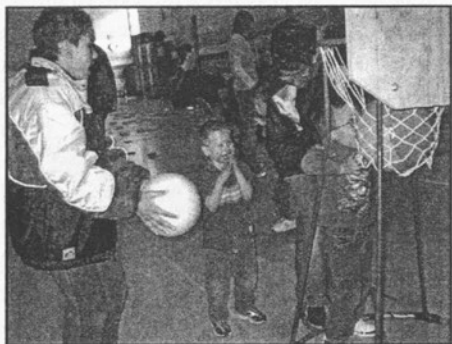
Students learn that everyone has rights.

You shouldn't make fun of someone because they have a disability or different qualities. You have to help them. This experience helped me learn about disabilities. As a leader, I had to make sure that no one made fun of them, called them names, or made them sad.